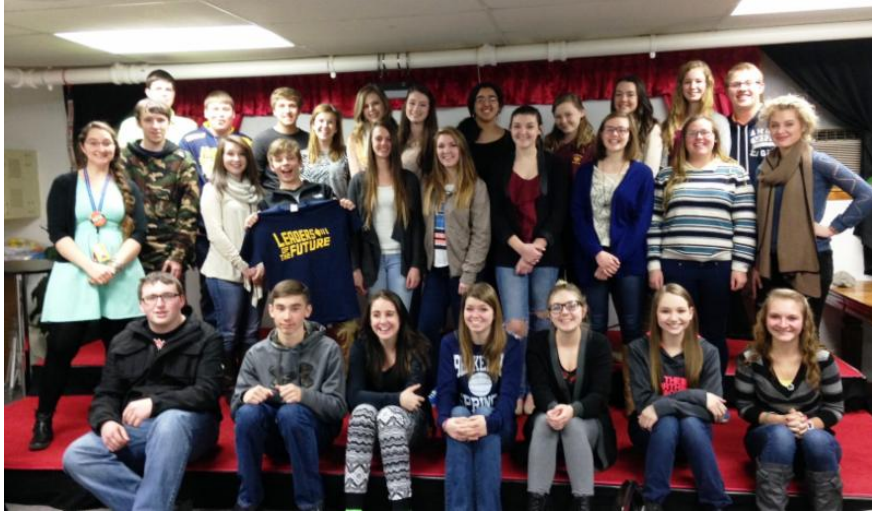
Youth Leadership Academy's Cohort 3- Completed Year 1 Track on February 24, 2015